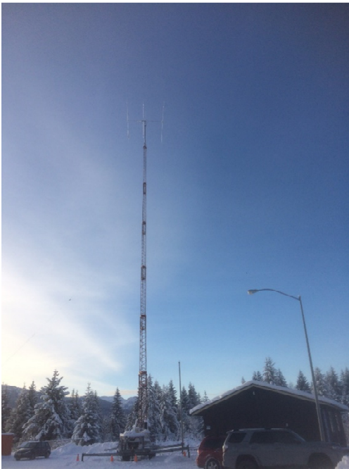
The tower trailer is up on a clear sunny day.